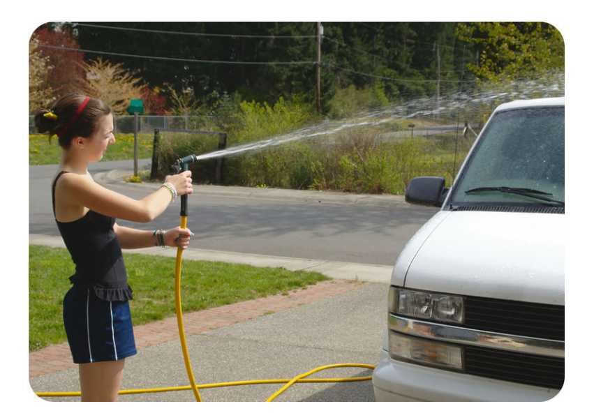
FIGURE 1.3 What will happen to the water that runs off the van? Where will it go?

sprinkler. You probably use water to wash the car, like the teen in Figure 1.3 . Much of the water used outdoors evaporates or runs off into the gutter. The runoff water may end up in storm sewers that flow into a body of water, such as the ocean.